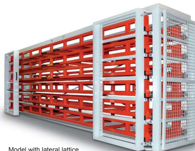
Model with lateral lattice door