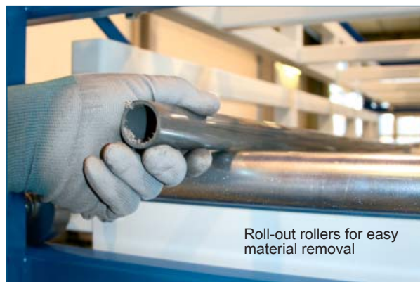
Roll-out rollers for easy material removal