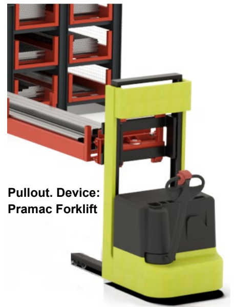
Pullout. Device: Pramac Forklift